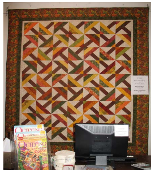
October Strip Quilt—Timber