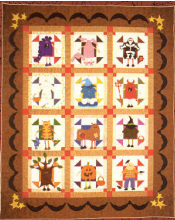
Ghost Club—Applique Block of the Month Starting in February 2010

Class #16—Dresden Plate will be Tuesday, December 1st from 6:30-9:30 pm or Wednesday, December 2nd from 10:30 am—1:30 pm.