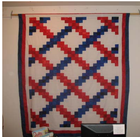
August Strip Quilt—Chain Reaction