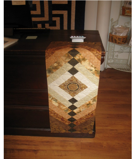
Log Cabin Runner

We offer a frequent shopper card that is good for $20 off after you reach $200 in purchases. The only exclusions are sales tax, gift certificates, classes, quilting services, and discounted items. Be sure to turn in your printed cards to switch to our automated tracking system.